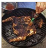
Grilled Chicken Recipes