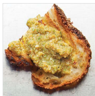
Recipes for Stale Bread