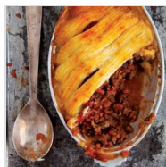
20 Easy Casseroles