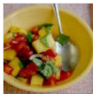
Refreshing Summertime Salads