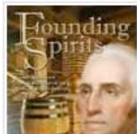
George Washington's Distillery at Mount Vernon