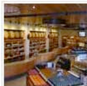
How One Winery Prospered Under Prohibition