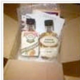
Pierre Ferrand Samples Arrive