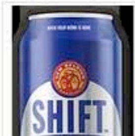
New Belgium Shift Pale Lager